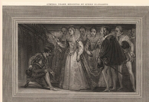
Admiral Drake knighted by Queen Elizabeth